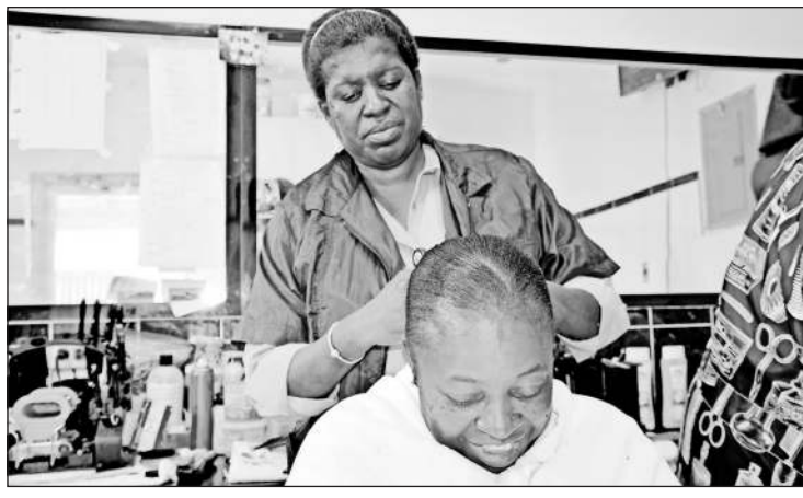
AT the Sandilands beauty salon, clients receive grooming services, can socialise with fellow patients, and can enhance or learn barbering/beautician skills.

From a therapeutic standpoint, "receiving a hair wash or haircut from a professional allows for the scalp to be stimulated, which helps to ease feelings of stress and anxiety that are often experienced by our patients. Persons receiving services leave feeling clean and with an overall sense of beauty