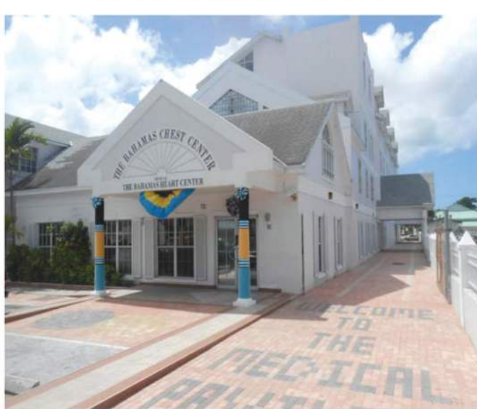
The Medical Pavilion Bahamas, TMPB, the Flagship Centre for Partnered Care, and Home to The Heart, Chest, Cancer, Imaging, Breast, Dialysis, Stem Cell and Research Centres at 72-74 Collins Avenue.

The Rt. Hon. Gaston Browne, Prime Minister of Antigua and Barbuda, along with his Minister of Foreign Affairs, the Hon. Charles Fernandez, toured the facilities of The Medical Pavilion Bahamas, TMPB, located at 72-74 Collins Ave., Friday, 27 th February, 2015.