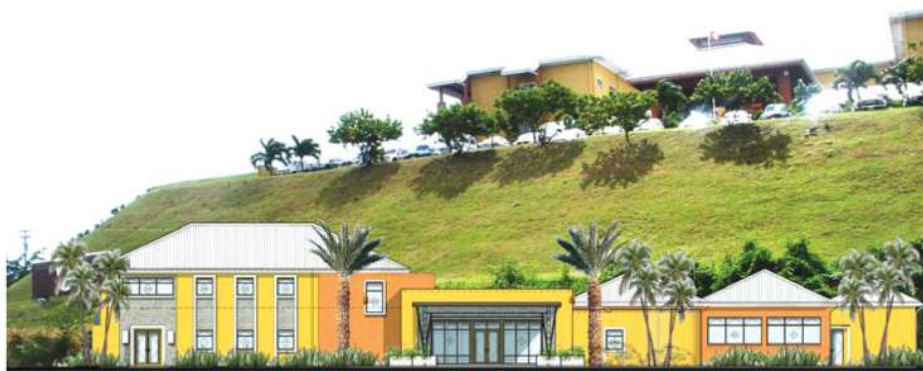
The Medical Pavilion Antigua sits complementarily at the foot of Mt. St. John's Medical Centre The Government of Antigua and Barbuda's Main Hospital Facility.

PM. Browne noted that "My Government is totally committed to the establishment of The Cancer Centre Eastern Caribbean (TCCEC) in Antigua even though the services will be more extensive than just offering cancer treatment.